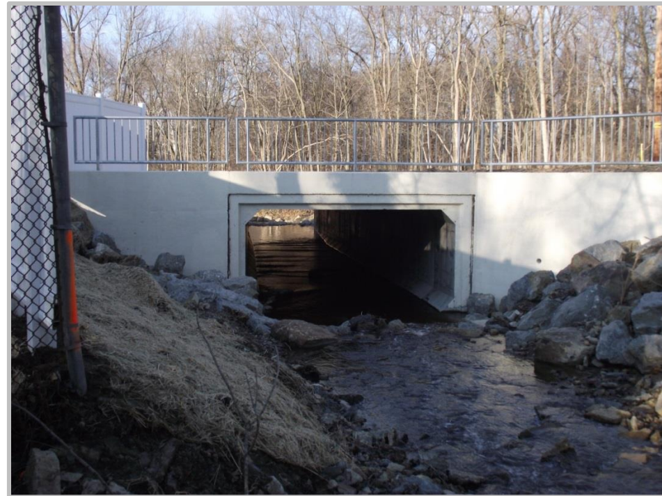
◉ Denlinger Road Before & After